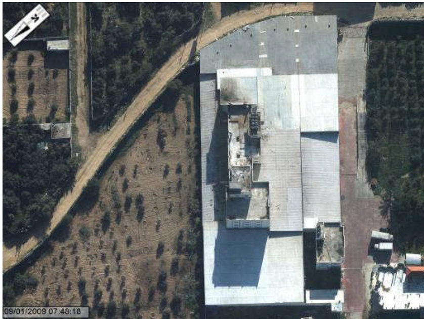
► El-Bader flour mill, 9 January 2009, prior to alleged incident